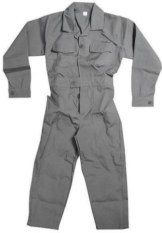
Overall for Plumbing levels 3,4 & 5 – Grey