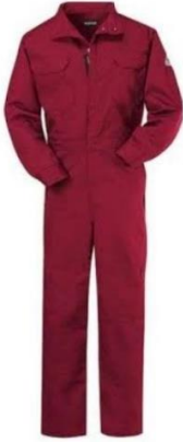
Overall for Carpentry levels 4&5 – Maroon