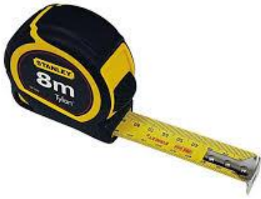
3.TAPE MEASURE - 5m and above