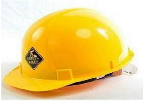
Safety Helmet yellow in color