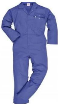
Overall for Architectural Technology Level 6, Architectural draughtsman level 5, Construction Management Level 6 & Quantity surveying level 6, Interior Design level 6 – Light Blue