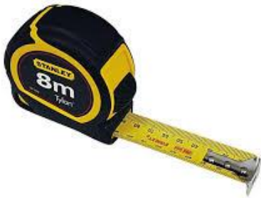
TAPE MEASURE – 5m and above