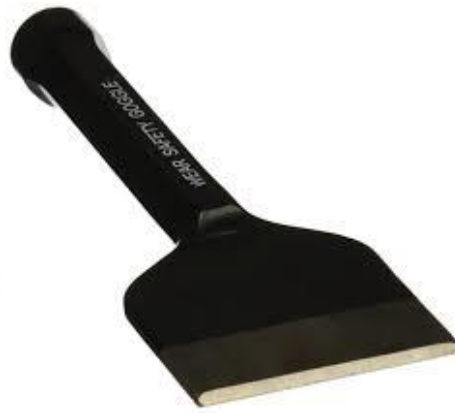
4.FLAT COLD CHISEL