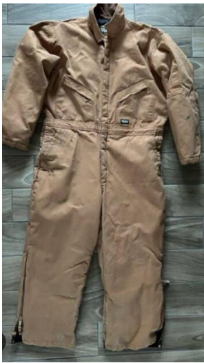
Overall for Building Level 6 – Brown