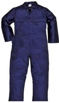
Overall for Civil Engineering Level 6, Water Technology Engineering Level 6 – Navy blue