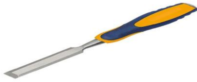
Chisel ½ inch