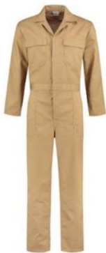
Overall for Building Technician level 5 – Beige