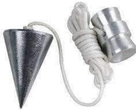
6.PLUMB BOB SIZE NO 6