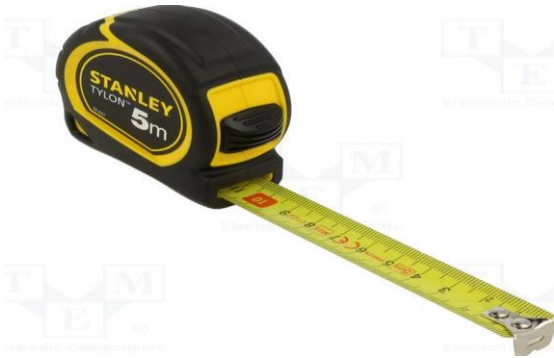
Tape measure – 5m and above