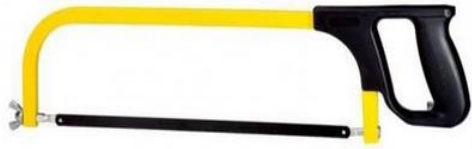
Hacksaw with blade